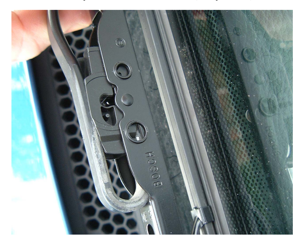
With clip in position, offer the Bosch wiper blade underneath.so pin in wiper will line up with slot in plastic clip. (pic above)

Insert plastic clip part way into "U" form of wiper arm, taking care not to push slot too far, so the bottom part of "U" form doesn't cover it.(see 2 pics above)