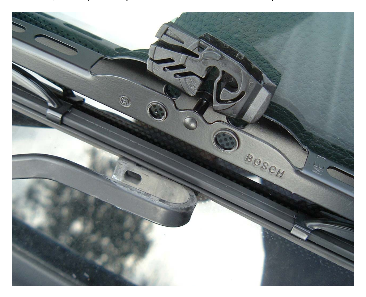
Here is Wiper Arm, Bosch blade and plastic clip.

First of all,remove plastic clip that comes installed with Bosch wiper blade.